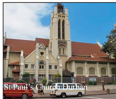
St Paul's Church Durban