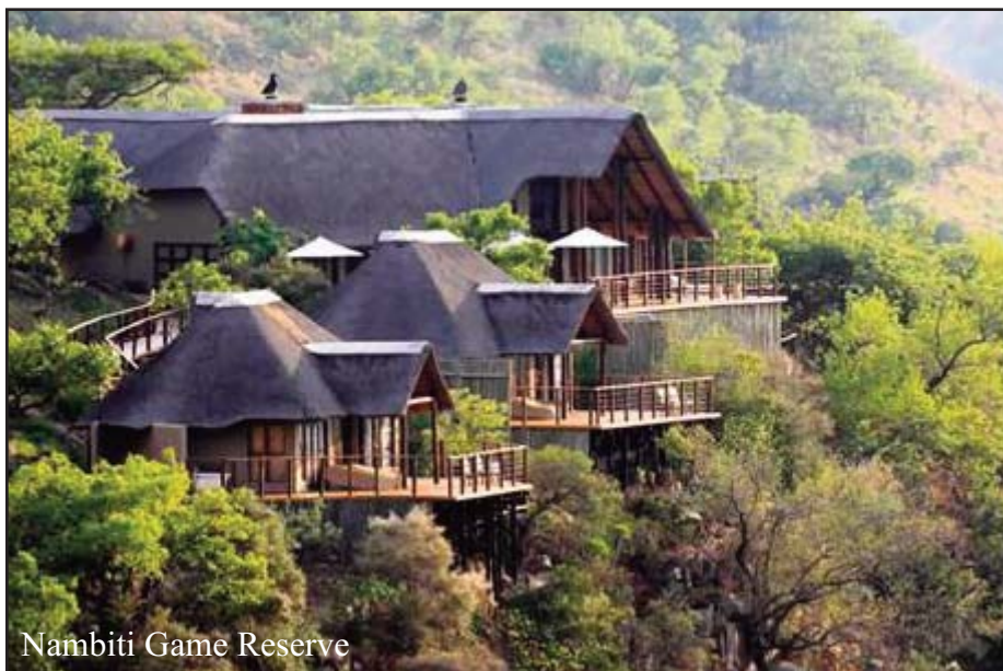
Nambiti Game Reserve