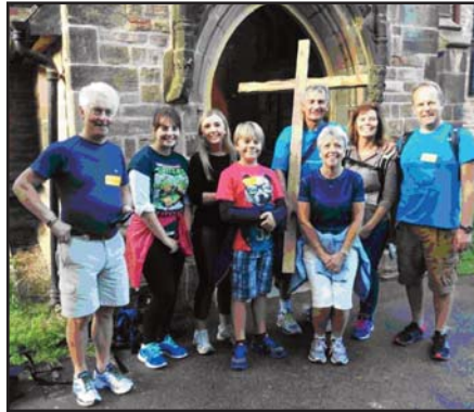
Walkers from Brinsley and Underwood