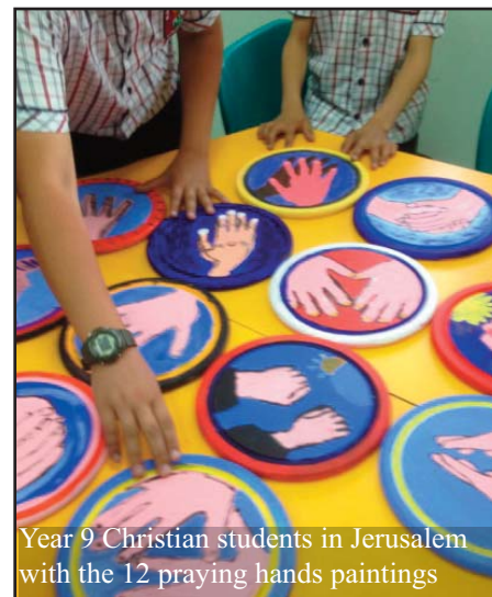
Year 9 Christian students in Jerusalem with the 12 praying hands paintings