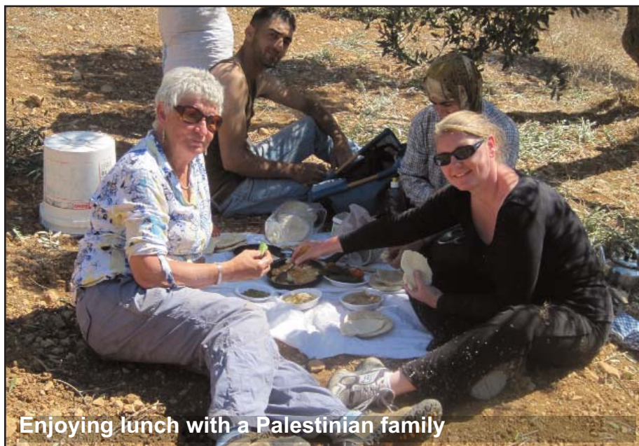
Enjoying lunch with a Palestinian family

We will be going to three main villages around Nablus in the West Bank - Burin, Madama and Kufr Qaddum. I thoroughly enjoy