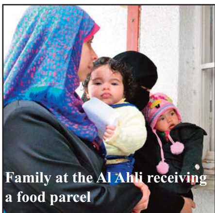
Family at the Al Ahli receiving a food parcel