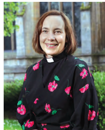
The Venerable Tors Ramsey Archdeacon of Newark