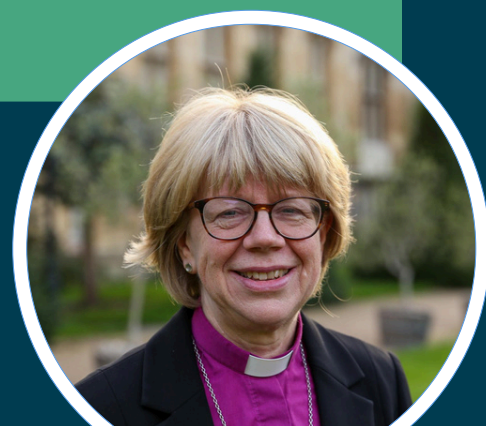
Archbishop Sarah Mullally

She passes on her thanks to all those working Caring For Creation: “Your leadership on environment and net zero carbon is a vital part of the Church's witness today. In caring for God's creation, you are helping the church live out its faith in practical, hopeful, and often challenging ways, offering a vision of responsibility and hope for the future.”